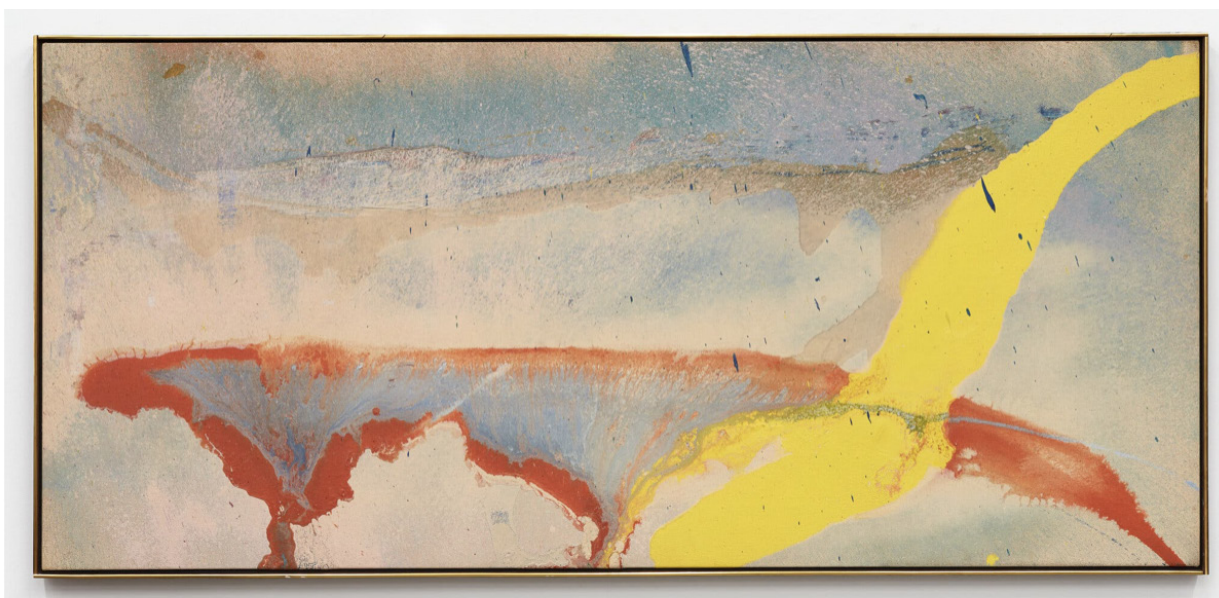
"Ruling Light," (1973) by Bradley. Acrylic paint is blasted across his canvases and slobbered into wayward puddles.